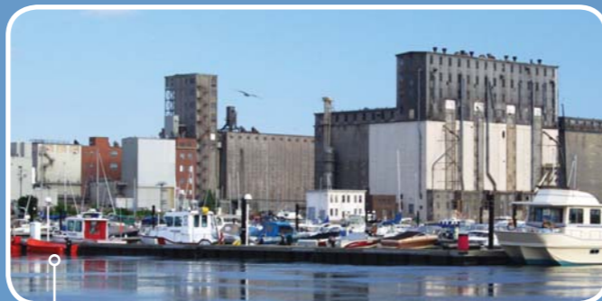
ADM Milling and Port Colborne Grain Terminal Flour Mill and Grain Terminal