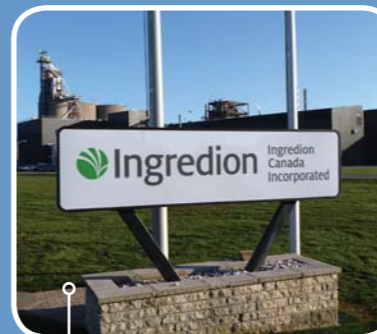
Ingredion Port Colborne Plant