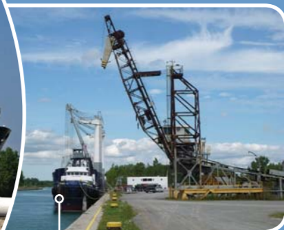
Port Colborne Quarries Aggregate Docking Facility