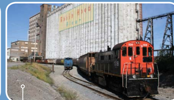
Trillium Railway & Riverland Ag Railway Service at Grain Storage Terminal